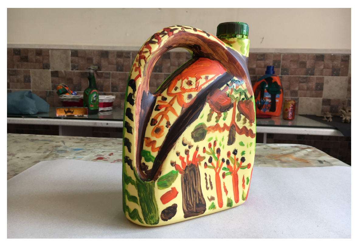
Figure 3. Khatereh Feyzi, 2022. My paintings.