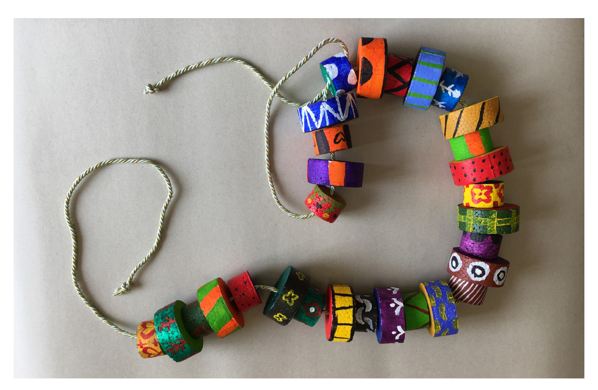
Figure 1. Fazila Teymuri, 2022. A necklace.

Our curatorial project aims to find ways to bring art to the homes of Afghan immigrants through mothers who are the central figures of families. The goal of the project is to have a tangible impact on the quality of life for the family and their social relationships. Although it seems non-essential or insignificant, our companionship with each other, and acquaintance with art, are definitely necessary and effective elements in this process. By challenging assumptions about single-use materials and claiming new activities with these materials, we promote the idea of repurposing, in relation to the family. What remains in the end is neither the material in its original form, nor an artwork that is conventional or familiar. I hope that women, who often and involuntarily migrate from country-to-country and from one city to another, can explore the possibilities of art with a keener eye than before.