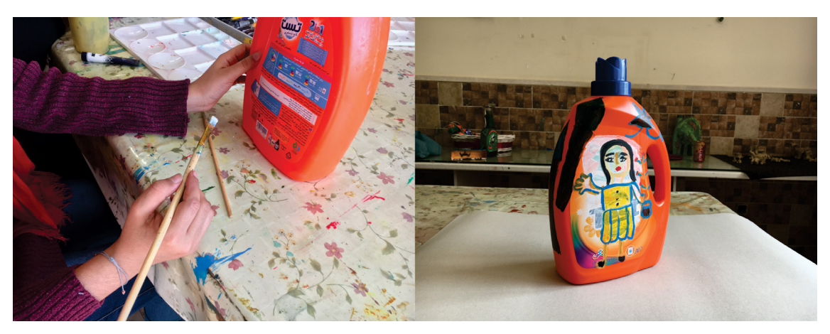
Figure 4. Golsoom Sadat, 2022. My process.