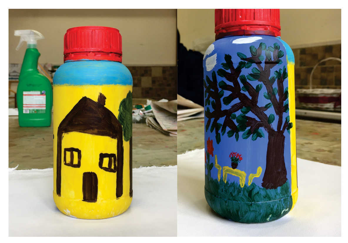
Figure 2. Fazila Teymouri, 2022. My home containers.